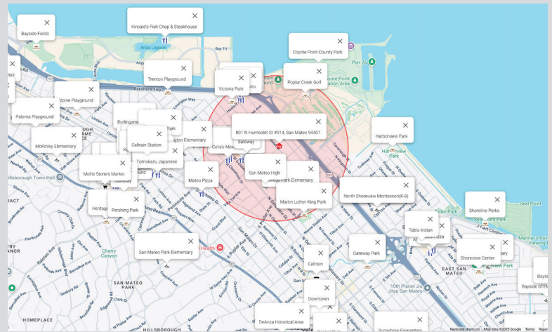
Red circle marks 0.5 miles around 801 N Humboldt St, San Mateo CA 94401